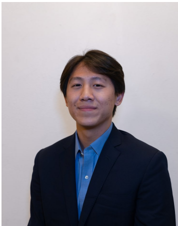
ALEX FAN CHAIR

Freedom! Revolution! Coffee? Take a trip with us to the Cafe Riche, a hub of intellectual, political, and revolutionary action in 1910s Cairo, Egypt. As World War I ends, Egypt reels from military exploitation at the hands of the British and broken promises from the Allies, and unrest grows in the countryside and city alike. The country finds itself at a crossroads—will Britain retain control over Egypt's political and economic functions, or will the people shake off British rule and establish an entirely new government? As the revolutionaries of Cafe Riche, delegates will aim to do the latter. On the weekend's menu is a drip-brewed mug of political machinations with a pump of Arabic literature, a medium-roasted carafe of state building, and a triple shot of a great time.